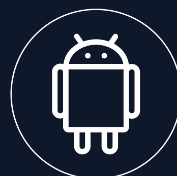
Android 12+Linux Dual-System