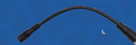
DC Patch Cord