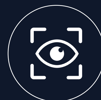
700cd/m 2 Brightness