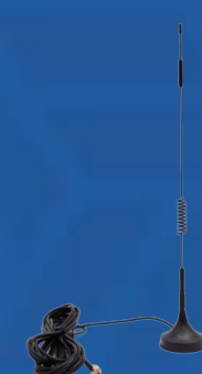
4G External Suction Cup Antenna