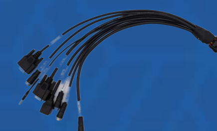
26-PIN Deutsch Interface Functional Bus