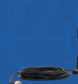
Data Radio External Suction Cup Antenna