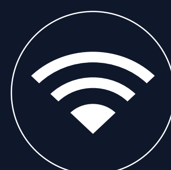
Dual-band WiFi 5