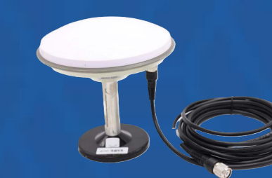
RTK Mushroom Antenna (TNC Connector)

* The technical specifications of this product are subject to change without prior notice