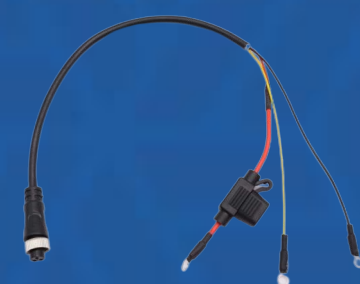
ACC Power Cord